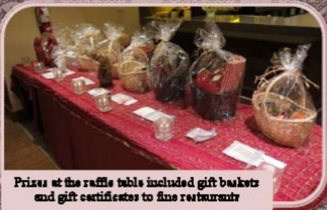
Prizes at the raffle table included gift baskets and gift certificates to fine restaurants