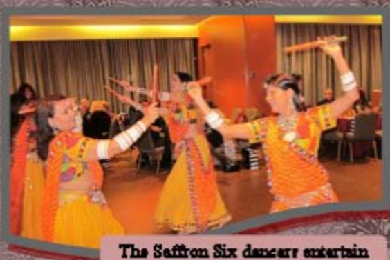
The Saffron Six dancers entertain with a Dandiya dance